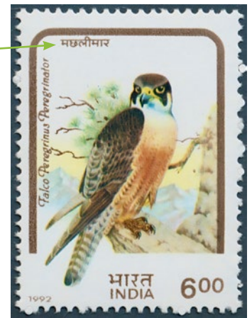
1. Error Stamp

One more issue which the Osprey and the Peregrine (Shaheen) stamps was a printing error so, to say an ornithological blunder. On the Rs 1 Face value stamp of the Osprey and the Rs 6 Face value stamp of the Indian Peregrine (Shaheen), the local Hindi names were mixed up and instead of mentioning "Machlimar" on the Osprey stamp, it was erroneously mentioned as "Shahin Kohila"