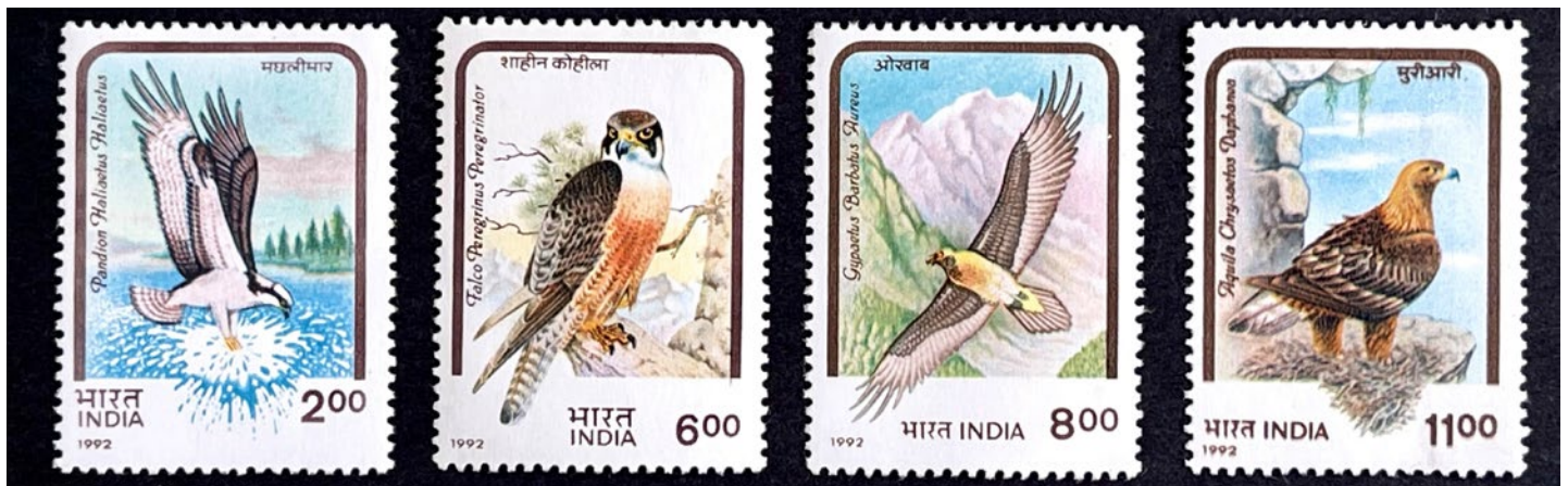
Figure 1: Image of birds of prey on the postal stamps - Osprey Pandion Haliaeetus Haliaeetus (Face Value: Rs 2); Shaheen Falcon Falco Peregrinus Peregrinator (Face Value: Rs 6); Lammergeier Gypaetus Barbatus Aureus (Face Value: Rs 8); Golden Eagle Aquila Chryseatos Dephanea (Face Value: Rs 11).

In Philately any stamp which is scarce is of high importance for collectors. The reason behind such scarcity can be due to some special factors or reasons. Collectors highly seek after such stamps and there is always a huge demand, leading to a very high price of such rarities. Interestingly two of such modern-day rarities have emerged from the set of the above Birds of Prey stamps issue of Dec 1992.