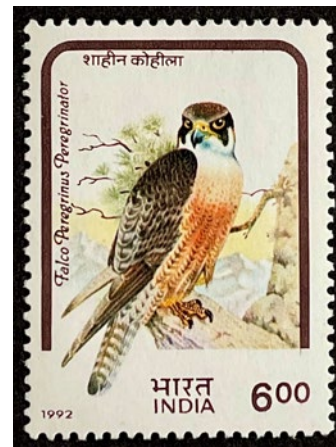
2. Official Release Stamp