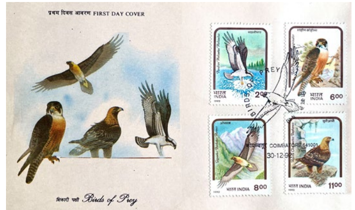
Figure 2: Image of a First Day Cover with a special Raptor pictorial cancellation issued by the Coimbatore General Post Office on 30th December 1992 (Day of release)

Eagle which has isolated records from North Gujarat and Kachchh areas (Ganpule et al. 2022).