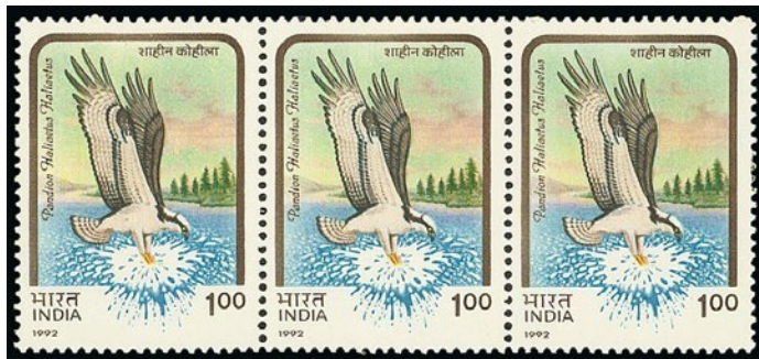
Figure 5: The Strip of 3 Known do date with the error

sought after a genuine expert certified copy of this Osprey stamp was last auctioned at the Spink Auction held on 18th Nov 2022 for 3,000 British pounds + bidders premium (3 Lakhs + Indian rupees). A similar realization was expected on a certified Peregrine (Shaheen) Stamp which came up for auction (Lot # 106) in May 2016 under the Christoph Gartner GmbH & CO KG auction. The Only Known do date a Strip of 3 stamps of Osprey variety was sold for a whopping sum of 15000 pounds + Premium (15 lakhs + Indian rupees) in 25th November 2014 Spink sale.