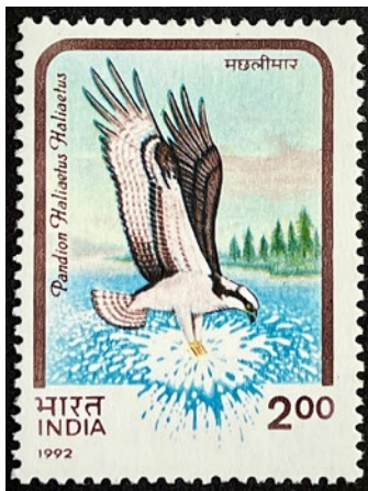
2. Official Release Stamp